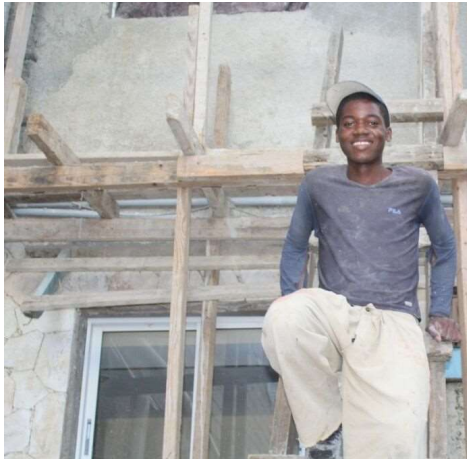
A former resident of La Maison l'Arc-en-Ciel in Haiti joins the ranks of employees thanks to his motivation.

This year, La Maison l'Arc-en-Ciel in Haiti is celebrating 25 years of existence: 25 years of supporting children and shining in the community through innovative projects and fighting prejudice against HIV/AIDS.